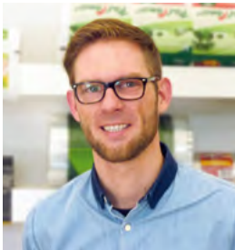
Florian Constabel Innovation Center